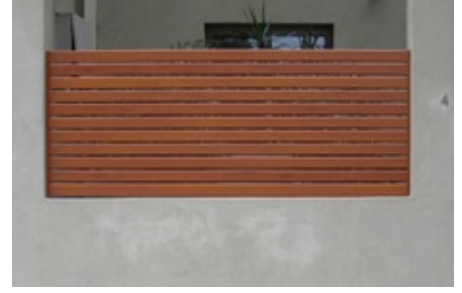
Horizontal timber finish on privacy screen and gate.

TWO SHOWROOMS OPEN 6 DAYS BROOKVALE & CARINGBAH