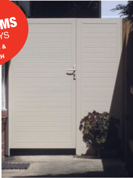
Complete privacy with butt joined slats in Stone Beige powdercoat.

TWO SHOWROOMS OPEN 6 DAYS BROOKVALE & CARINGBAH