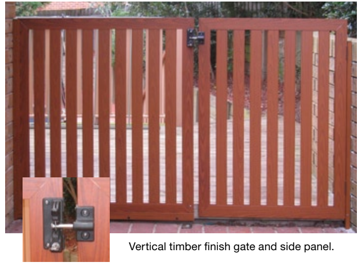
Vertical timber finish gate and side panel.