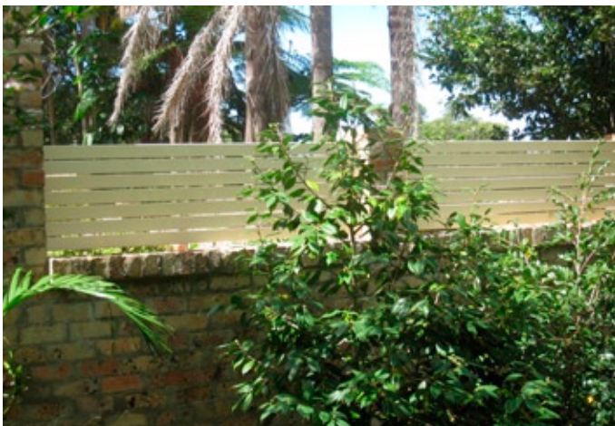
Primrose powdercoated slats.