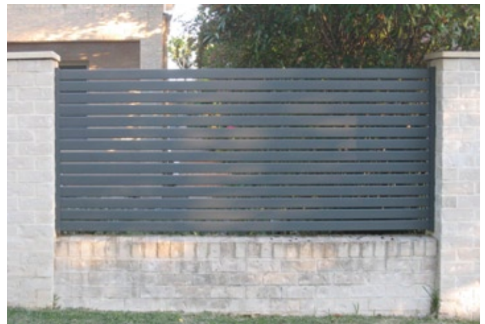
Woodland Grey powdercoated slats.